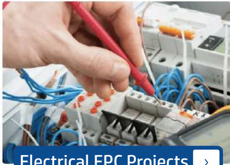
Electrical EPC Projects >