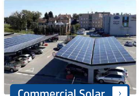
Commercial Solar >