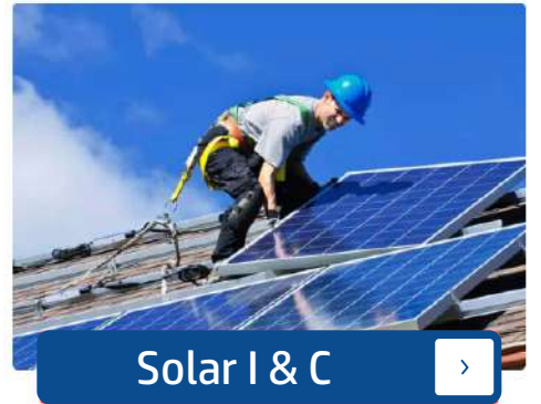
Solar I & C >