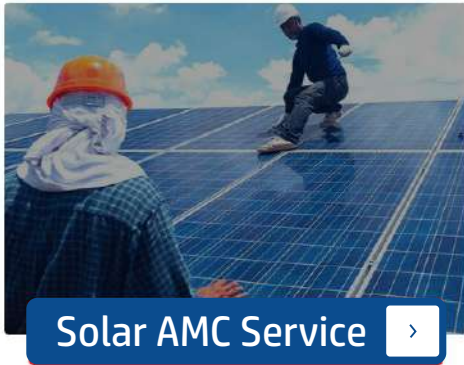
Solar AMC Service >