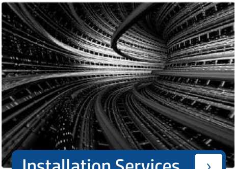
Installation Services >