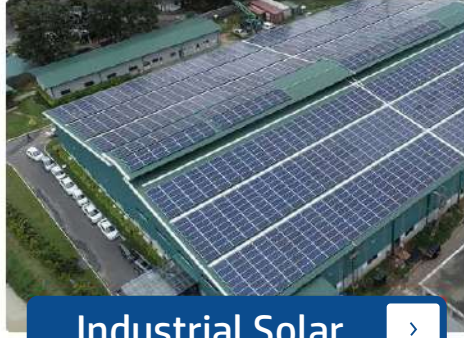
Industrial Solar >