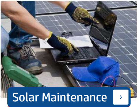
Solar Maintenance >