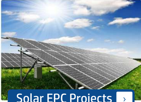
Solar EPC Projects >